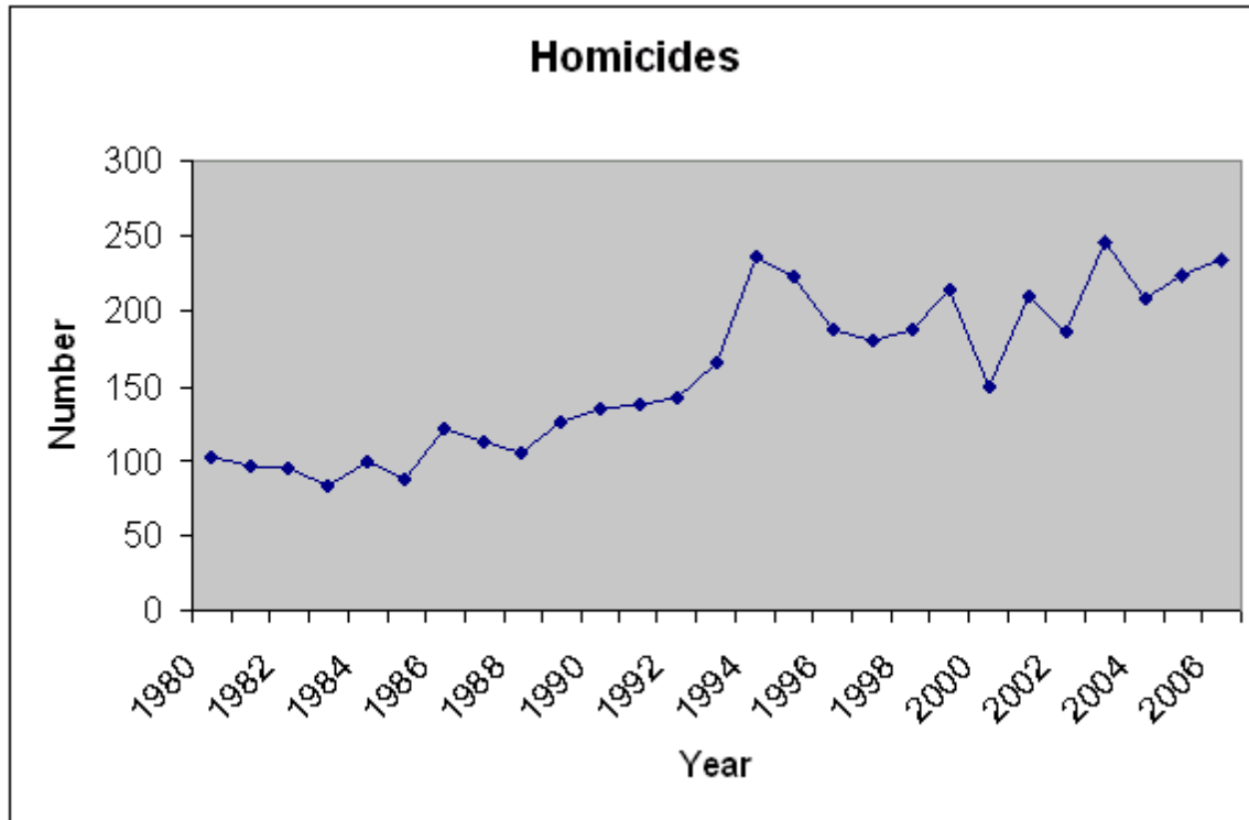
Exhibit 3- I: Homicides and Clearances in Phoenix, 1980-2006